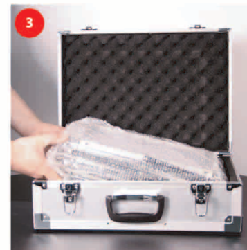
3 REMOVE UNIT FROM HARD CASE