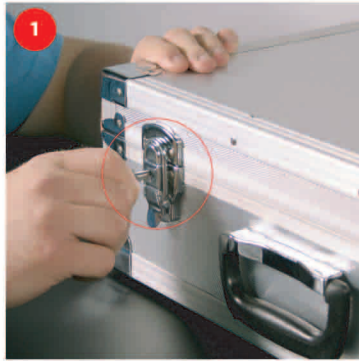
1 IF LOCKED UNLOCK HARD CASE.