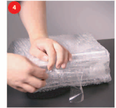
4 REMOVE BUBBLE WRAP FROM UNIT