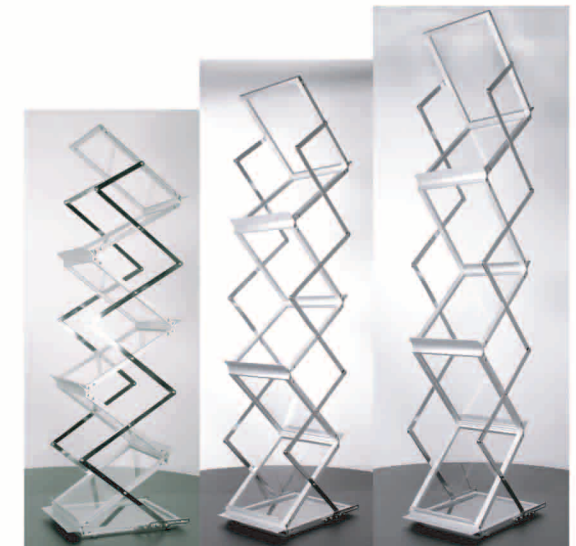
PIN SET IN FIRST GROVE

TO COLLAPSE THE UNIT, REPEAT SETUP INSTRUCTIONS IN REVERSE. BE CAREFUL RETRACTING UNIT