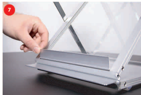
7 SWING OPEN FLAP ON THE BOTTOM SECTION. (MAKE SURE TO FLIP BOTTOM SECTION FLAP FLAT ONTO GLASS BEFORE ATTEMPTING TO RETRACT.)

TO COLLAPSE THE UNIT, REPEAT SETUP INSTRUCTIONS IN REVERSE. BE CAREFUL RETRACTING UNIT