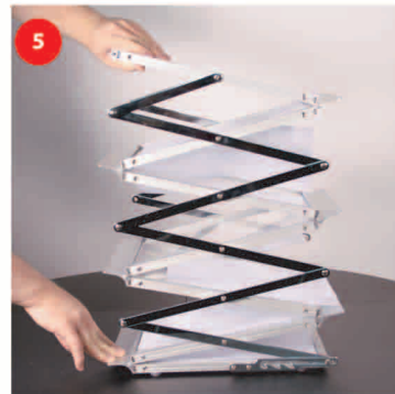
5 WHILE HOLDING DOWN THE BASE LIFT TOP SECTION OF THE UNIT .