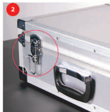
2 OPEN BOTH LATCHES ON THE HARD CASE