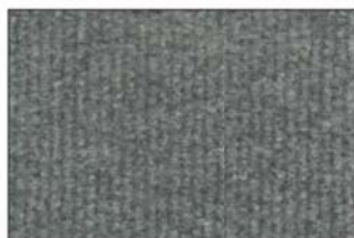
R03 Charcoal PMS 424C / 425C