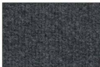
R15 Cinder PMS 426U