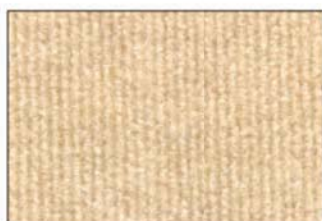
R07 Sand PMS 467U