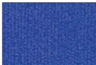
R05 Pacific PMS 280C