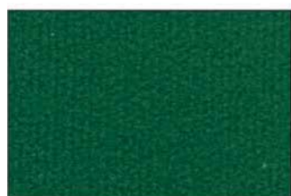
R09 Kelley Green PMS 3425C