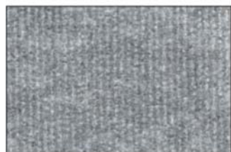
R02 Steel PMS 429U / 430U