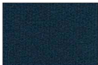
296 Nebula PMS 2767C