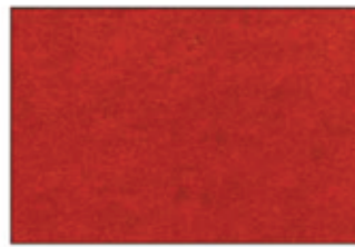
R11 Chili Pepper PMS 187C