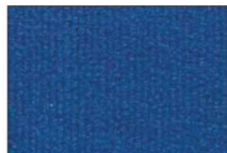
R06 Indigo PMS 294U