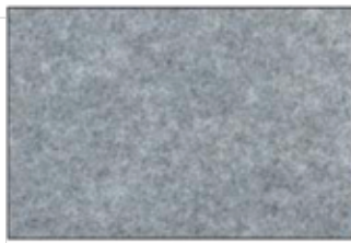
R02 Steel Chrome PMS 429U / 430U