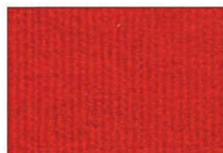
R11 Electric Red PMS 187C