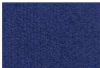
R04 Monarch PMS 281C / 282C