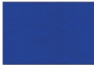
R05 Electric Blue PMS 287