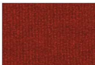
R08 Merlot PMS 195C