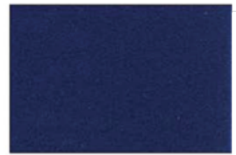
R04 Sapphire PMS 281C / 282C