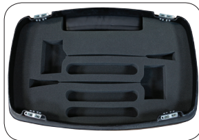
Foam padding for lights