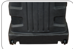
Recessed wheels and handle