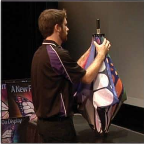
Set ShowFlex upright on table