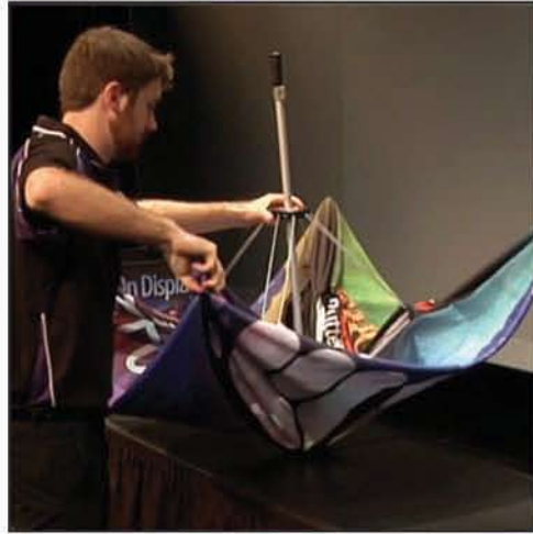
Unfold unit by pushing hub toward table