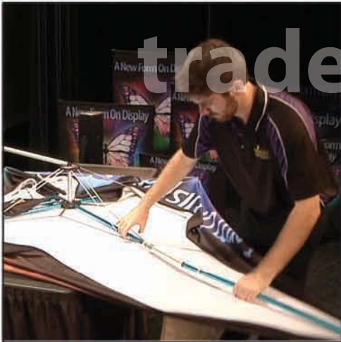
Unfold arms and lock spring loaded sliders