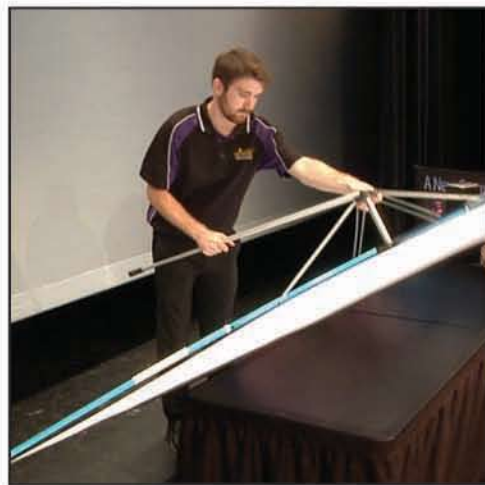
Stand ShowFlex upright to complete setup