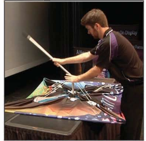
Pivot telescoping leg 90° to lock hub.