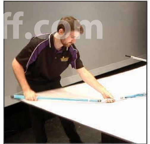
Unfolding last arm stretches fabric tight