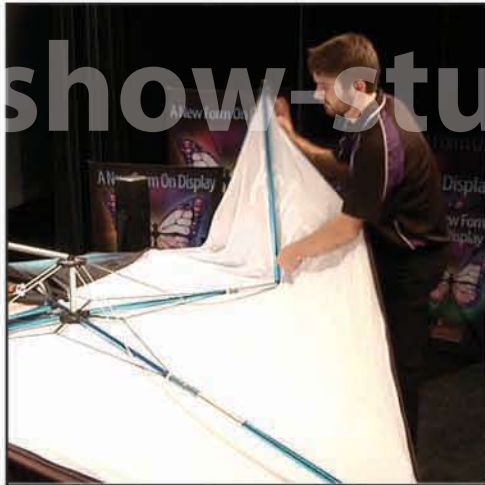
Unfold remaining arms locking the sliders