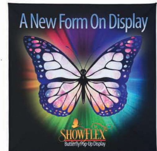
Ready to show!