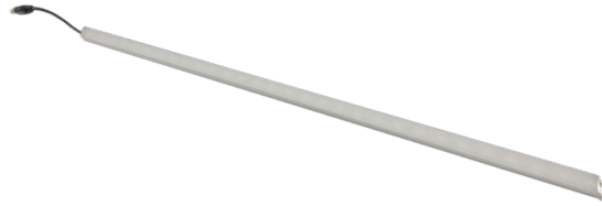
USB LED Light Strips (x4)